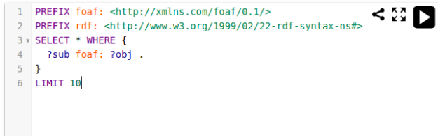
Fig. 2. The YASQE interface

YASQE 22 (See Figure 2) is an extensive JavaScript library, targeted at Semantic Web publishers. YASQE takes a simple HTML text area, and – with one JavaScript command – transforms it into a full featured IDE-like SPARQL query editor.